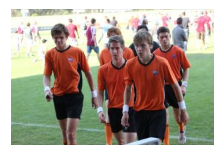
Umpires from the 2011 First Division Grand Final