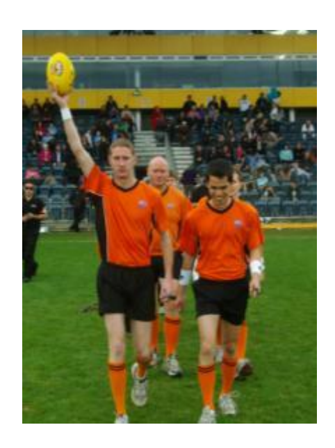
Umpires from the 2011 Second Division Grand Final