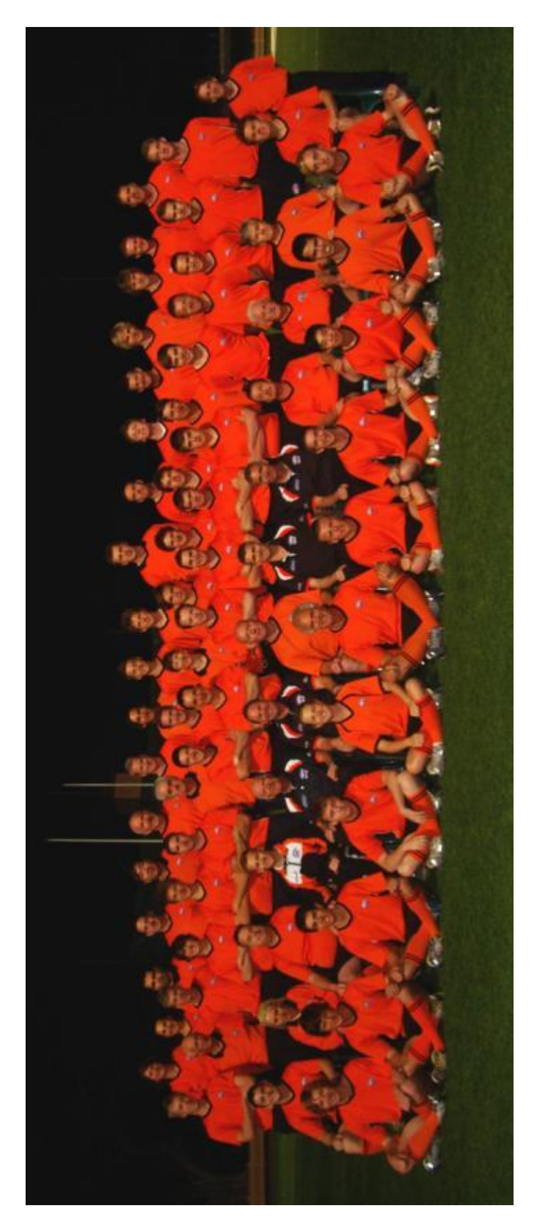
The 2011 AFL Sydney Umpiring Panel