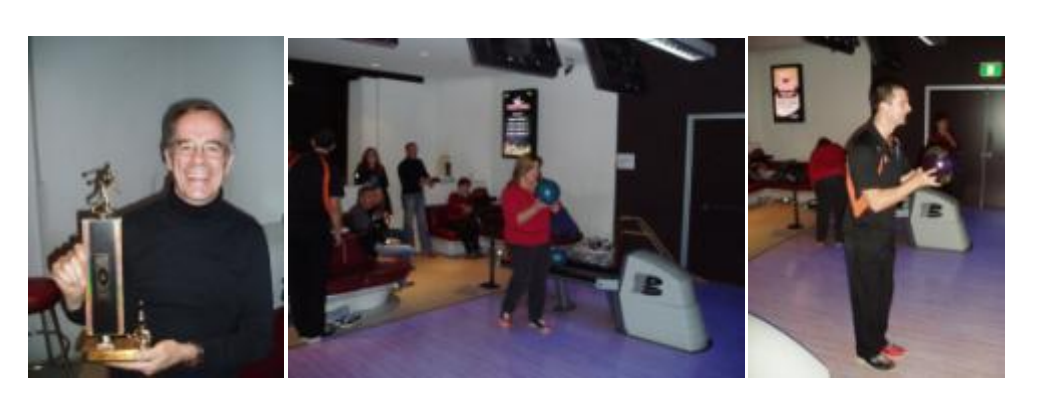
Ten Pin Bowling