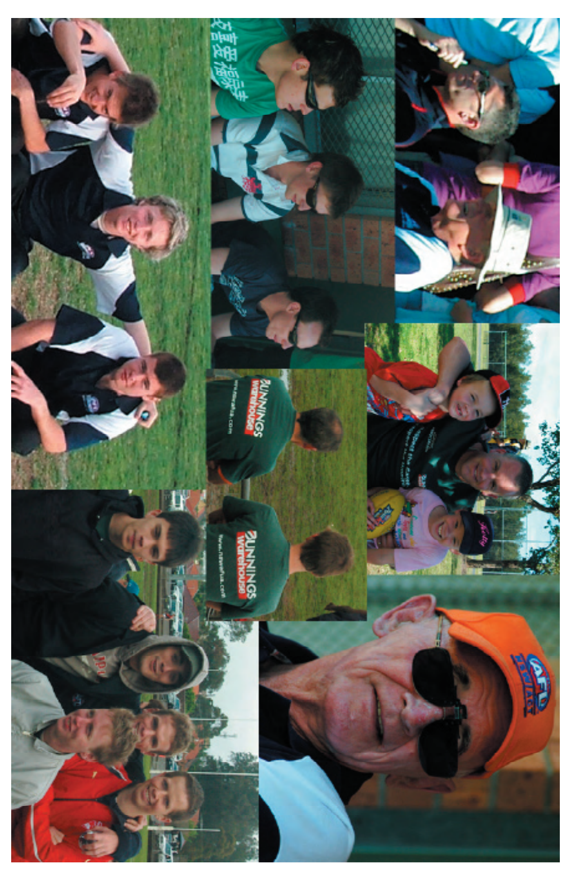
Out and about at the 2006 Sydney AFL Final Series