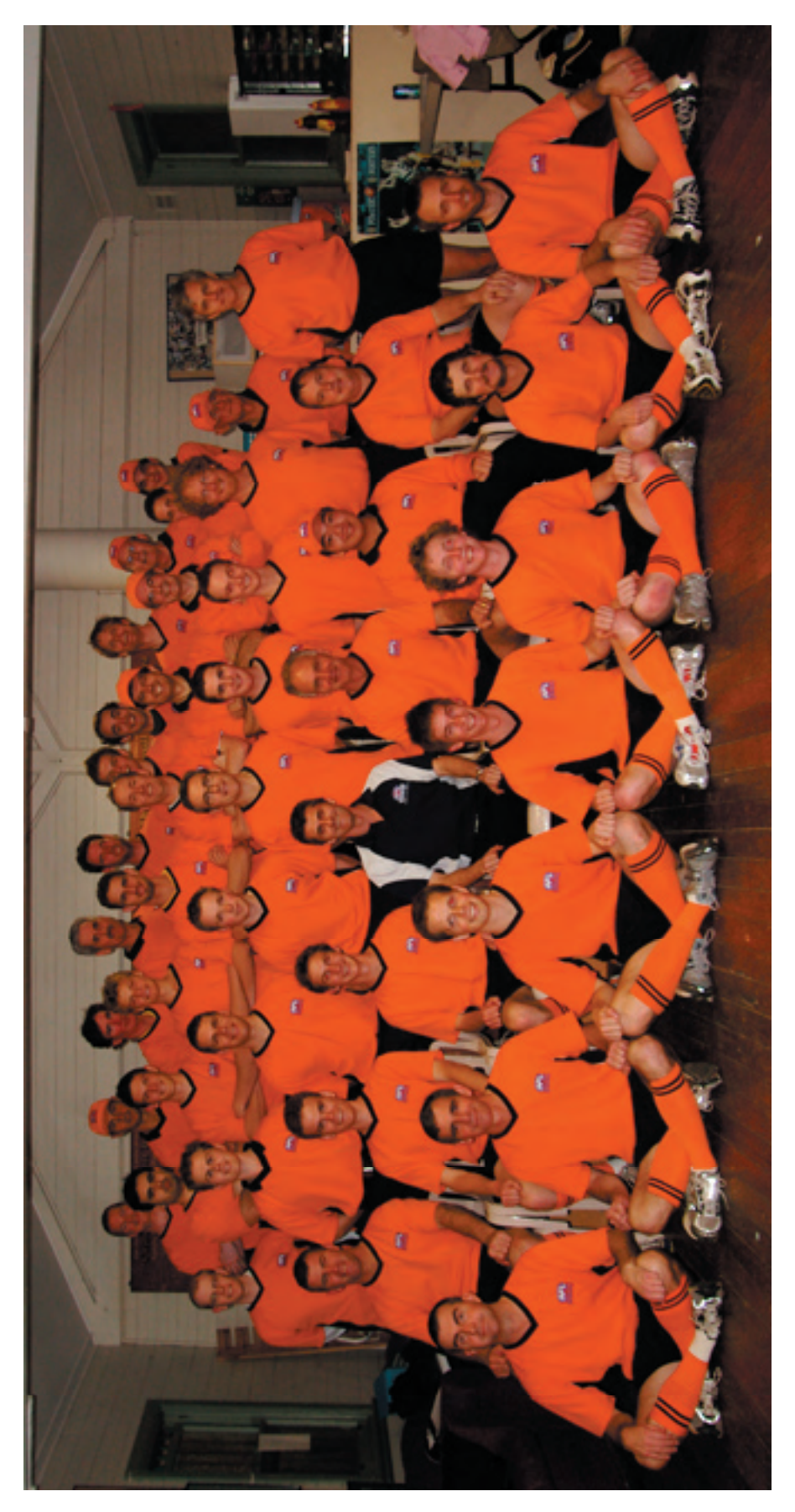
The 2006 Group