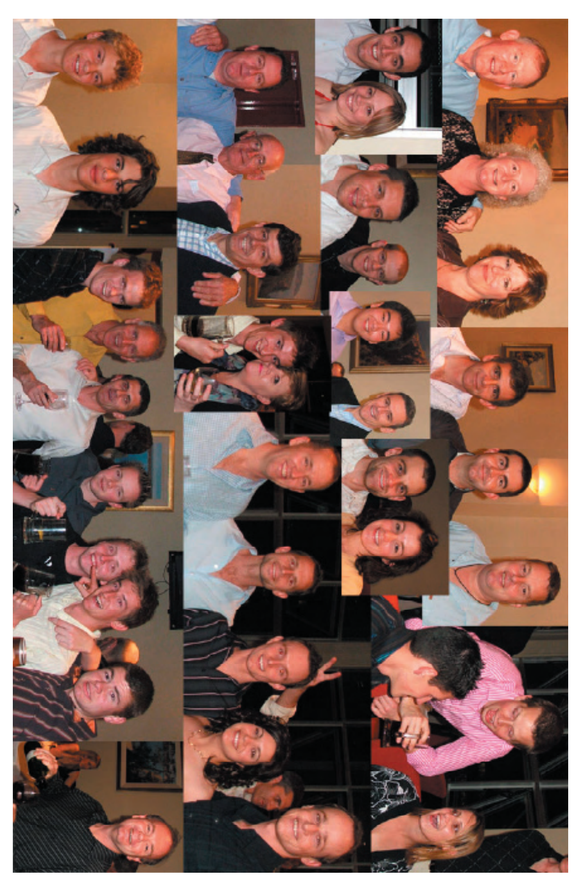
Action from the 2006 Presentation Night