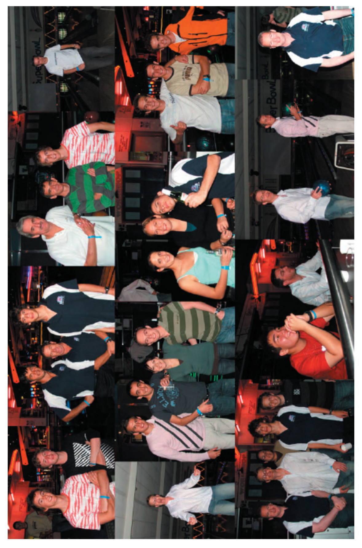
Action from the Second Annual Ten Pin Bowling Night