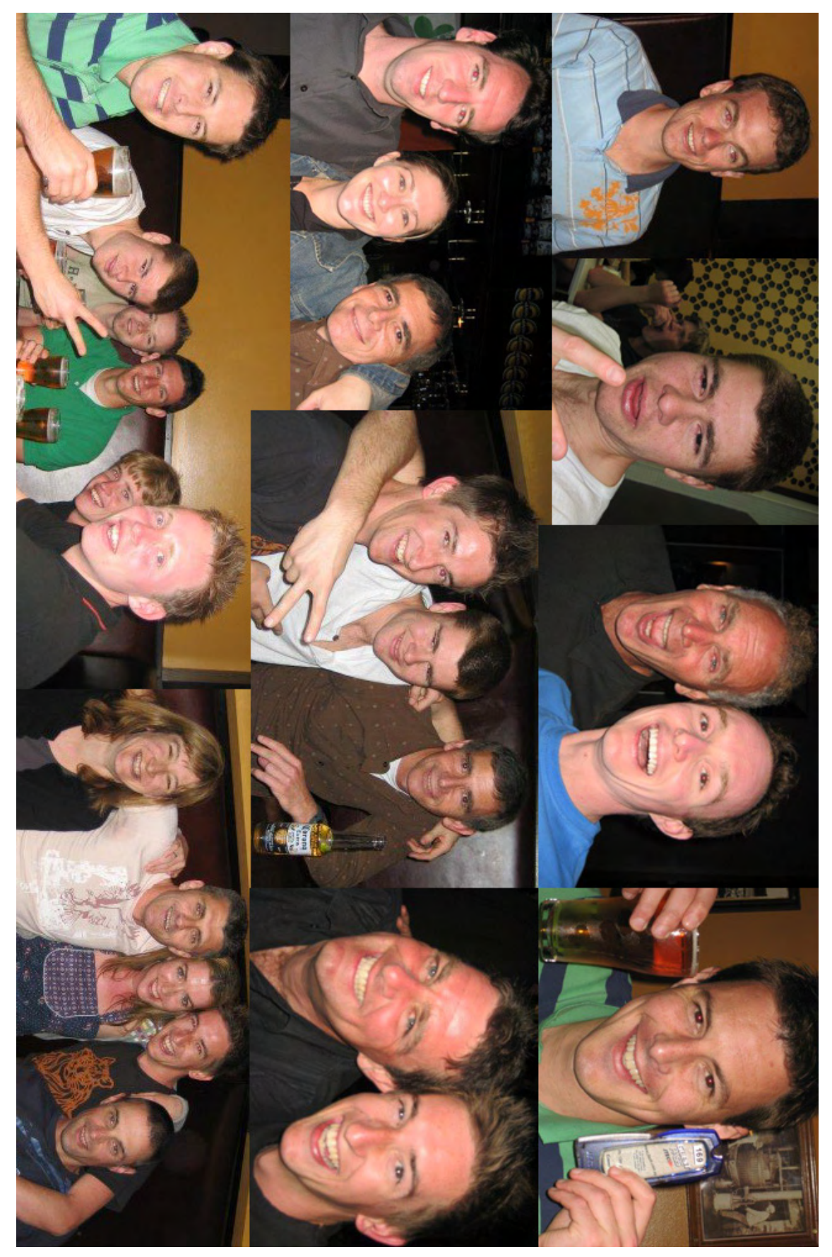
Grand Final Night Drinks