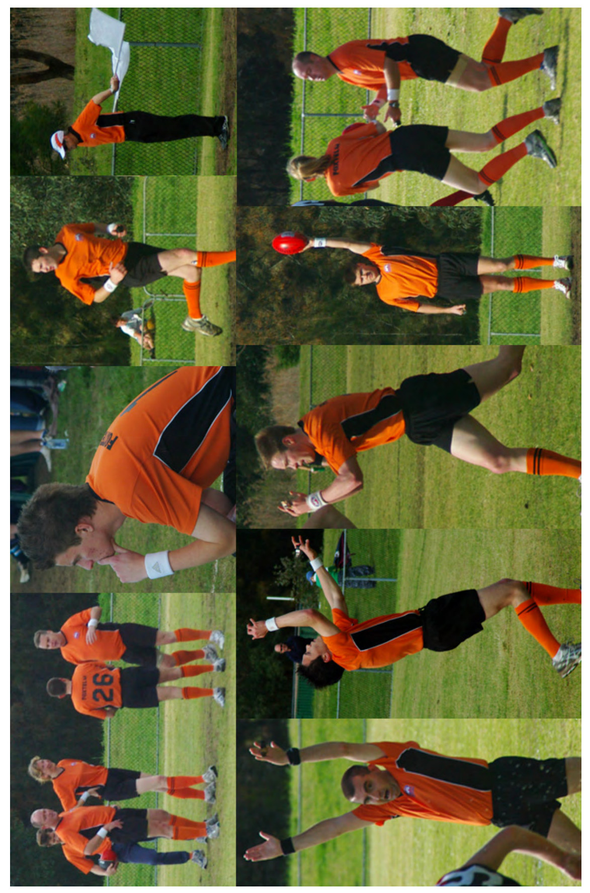
Action from the First and Second Division Grand Finals