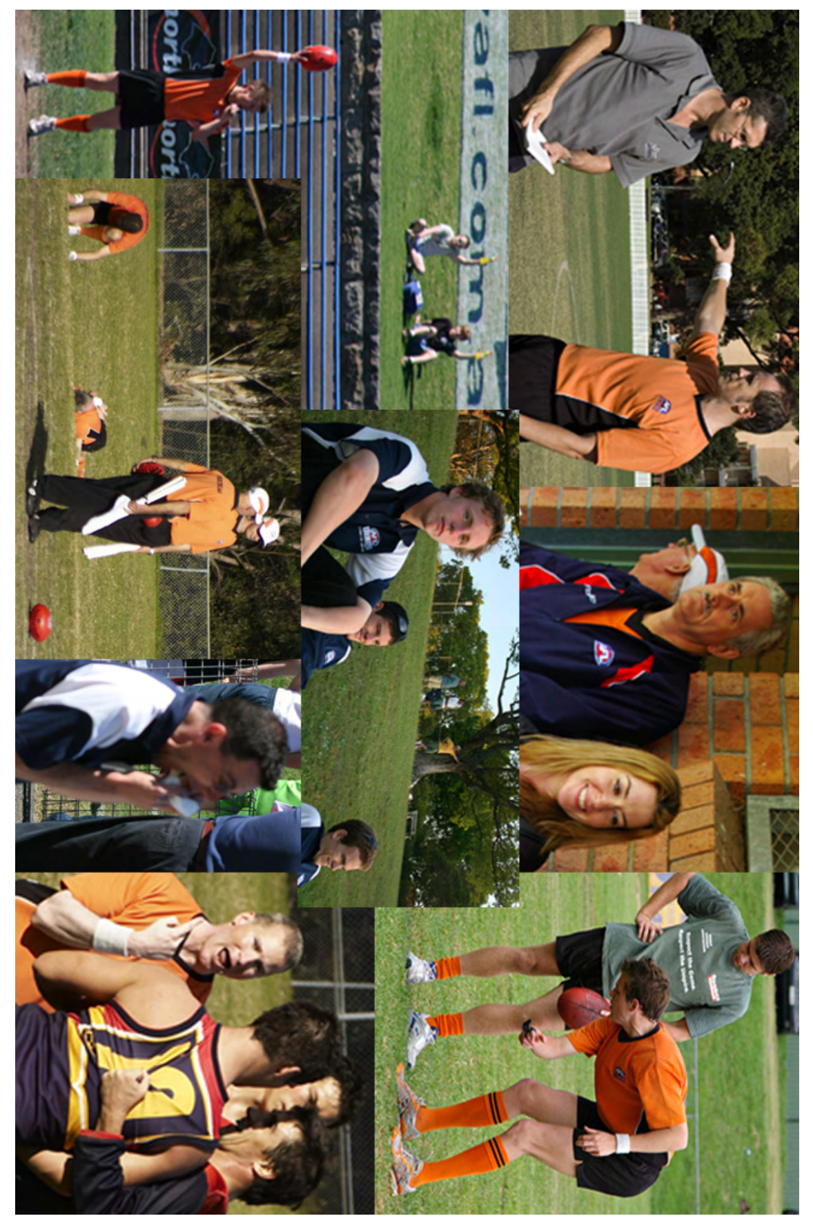
Action from the 2007 Season