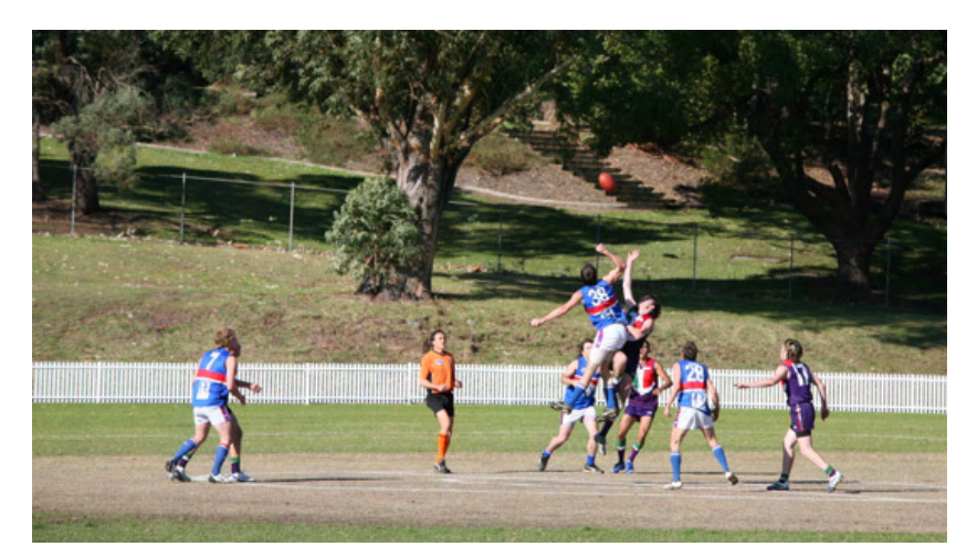
Action from Drummoyne Oval

In summary, I am pleased to announce that the Association has run at an operating surplus for the second year running. It is the challenge for any future Committee to continue this trend of financial strength - to improve the position of the Association such that it can deliver for its Members and weather any potential downturns.