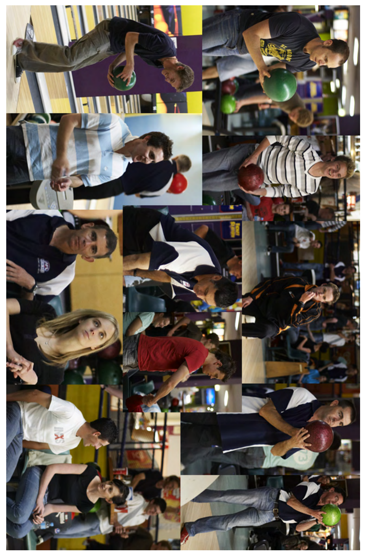
The Third Annual Ten Pin Bowling Night