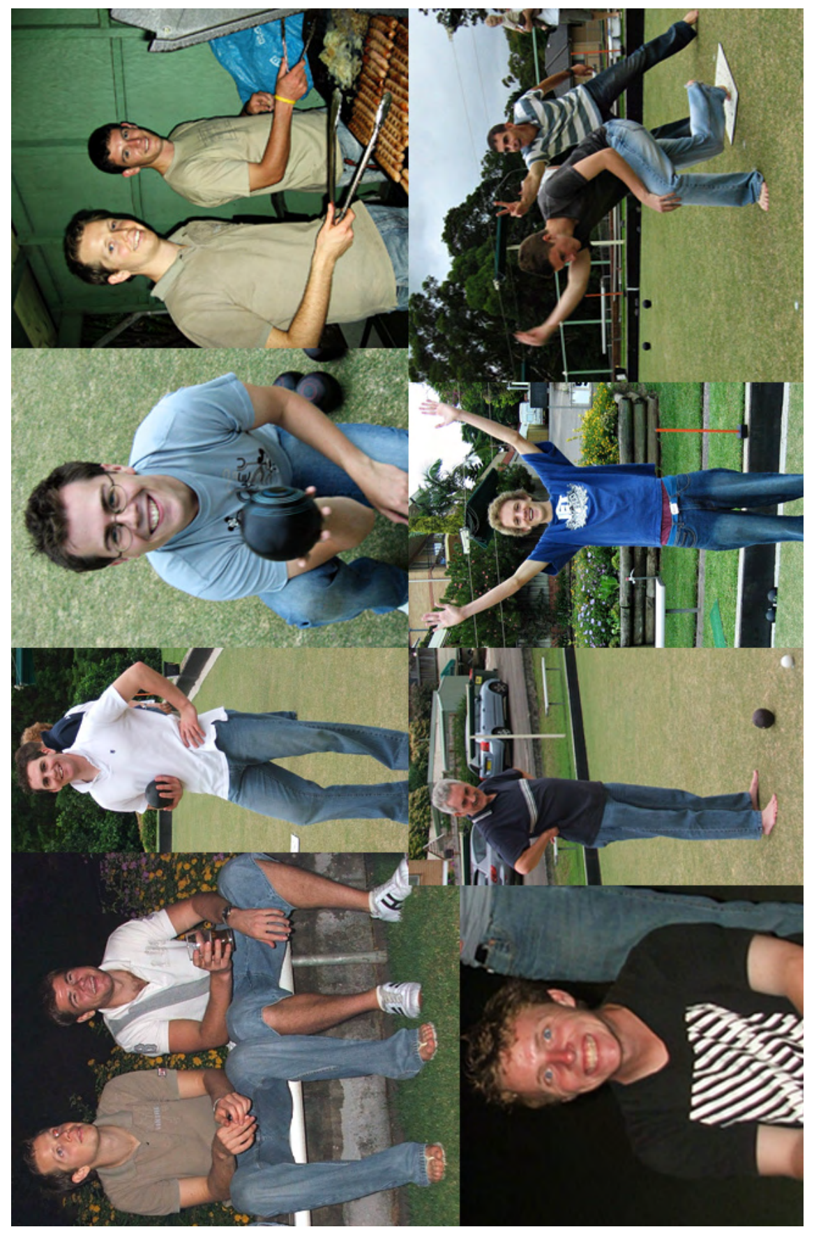
The Lawn Bowls Night