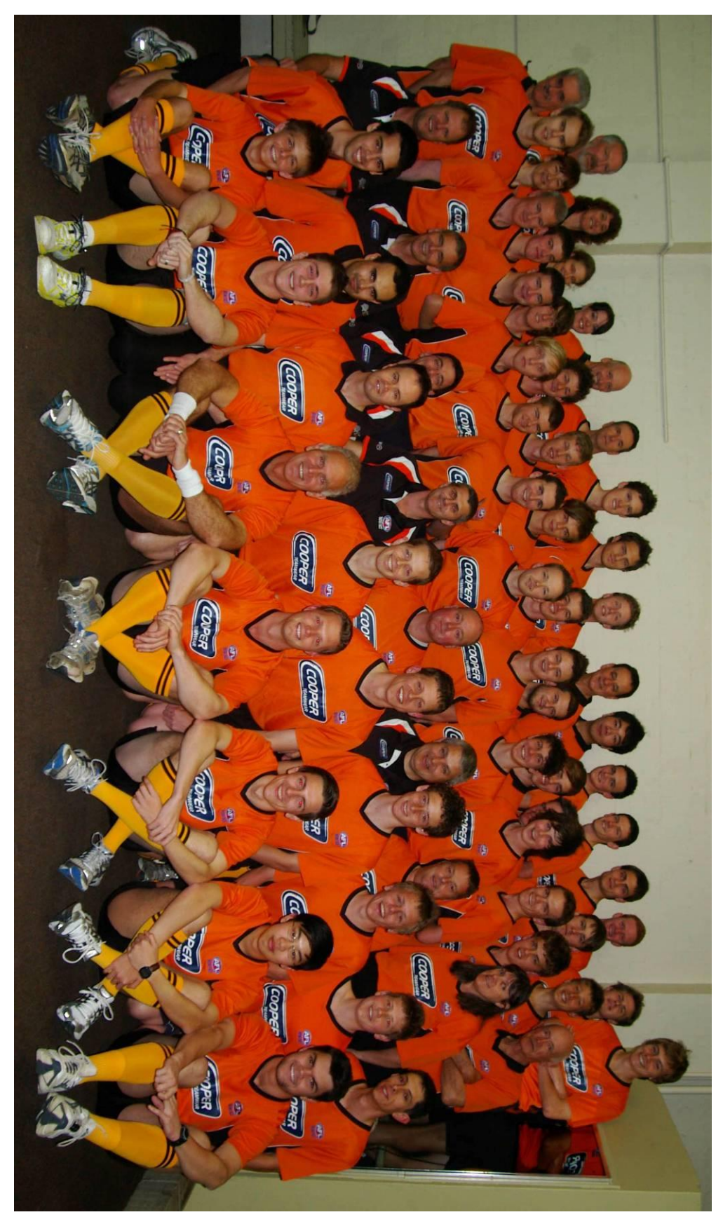
The 2010 AFL Sydney Umpiring Panel