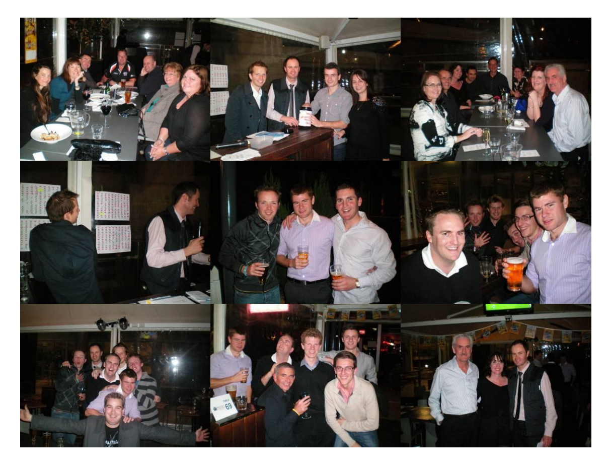
Guests at the 2010 Reverse Raffle