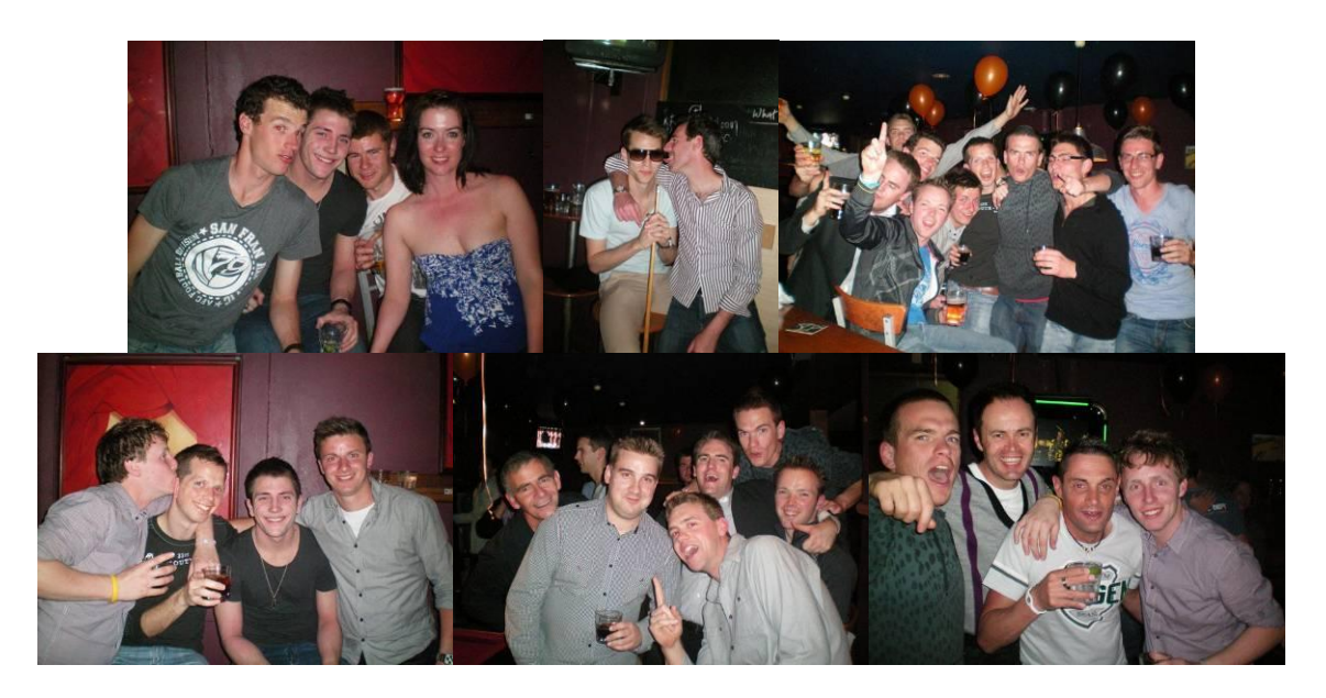
Guests at the 2010 Grand Final Night Drinks